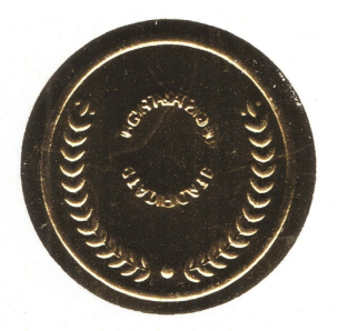
QSA INTERNATIONAL LIMITED 27, Old Gloucester Street, London, WC1N3AX, ENGLAND