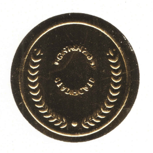
QSA INTERNATIONAL LIMITED 27, Old Gloucester Street, London, WC1N3AX, ENGLAND

This certificate is a property of QSA International, UK. This certificate must not be altered in anyway and shall be returned upon the request by QSA International.